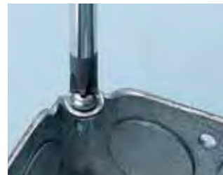
Junction Box Screw

Different sizes of Combination Fasteners mean using different tools, right? Wrong! The Combo Head™ was designed to fit snugly into multiple sizes of Combo Screws, eliminating the need to buy more bulky tools. Among the competition, the IDEAL Combo Head™ tip features the most touch points, minimizing cam-out and stripping. See and feel the difference for yourself!